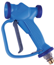
T-TWSGV65SVL (Trigger Valve)