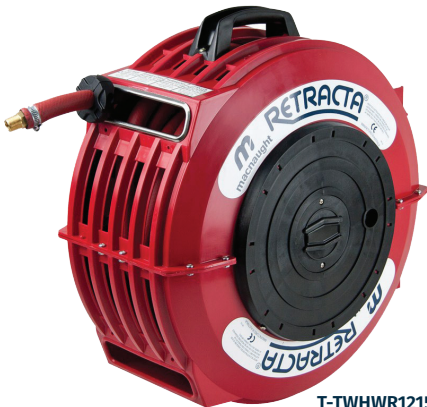
T-TWHWR1215 (Hot Wash Reel)